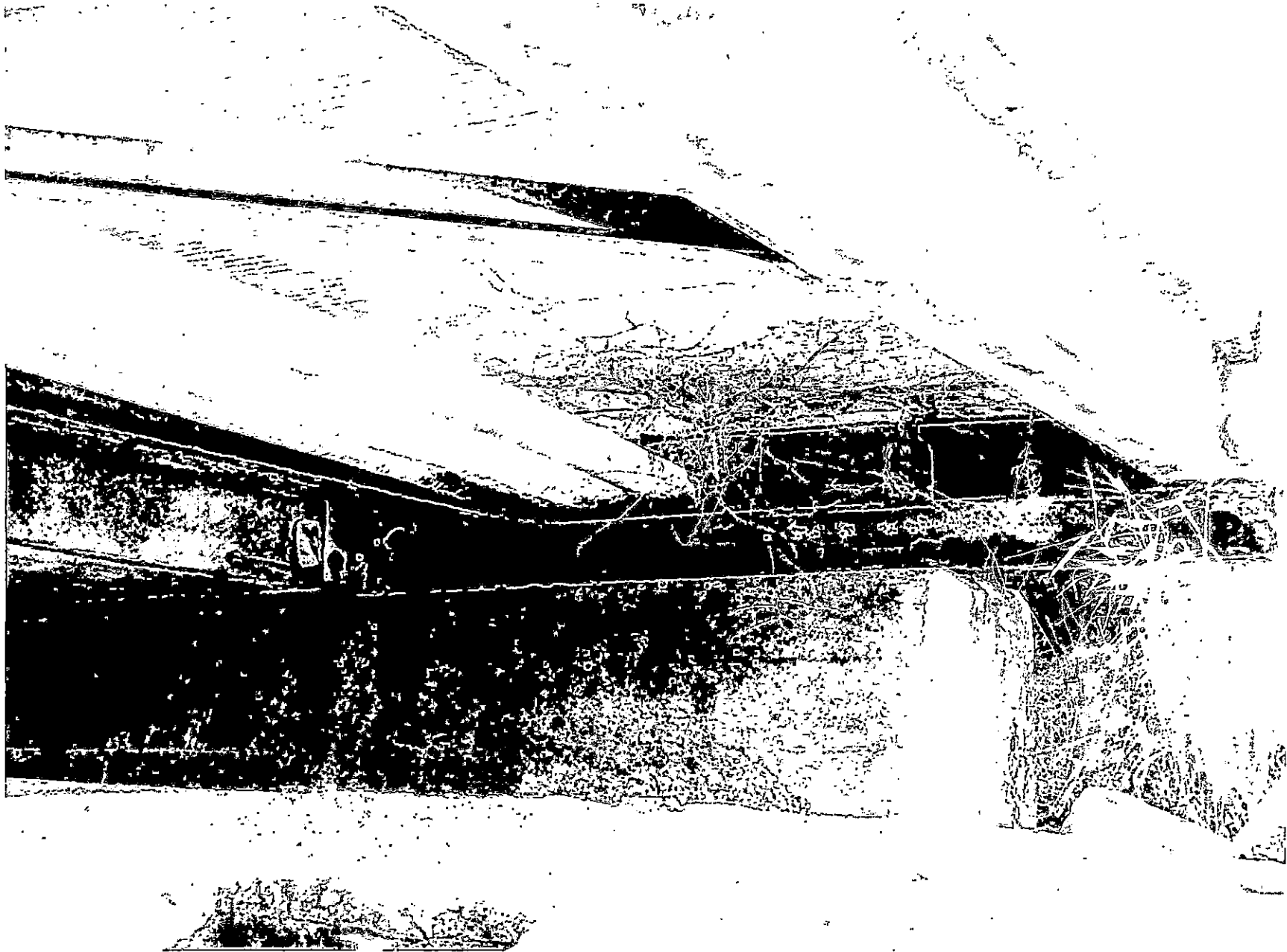
EAST ABUTMENT HEADER, SOUTH SIDE